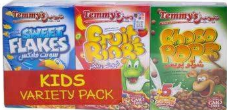
KIDS VARIETY PACK