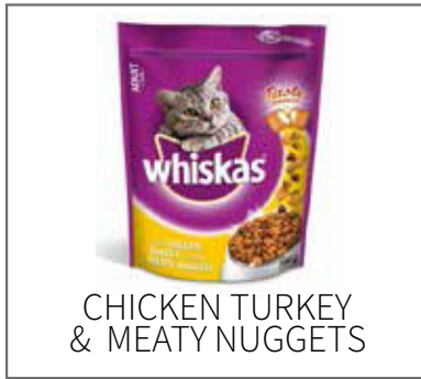
CHICKEN TURKEY & MEATY NUGGETS