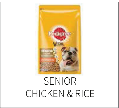
SENIOR CHICKEN & RICE