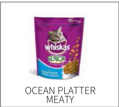
OCEAN PLATTER MEATY