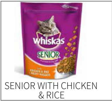
SENIOR WITH CHICKEN & RICE