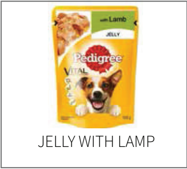
JELLY WITH LAMB