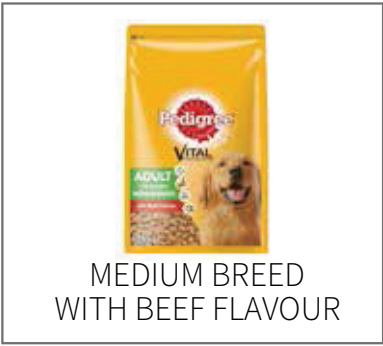
MEDIUM BREED WITH BEEF FLAVOUR