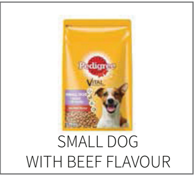
SMALL DOG WITH BEEF FLAVOUR