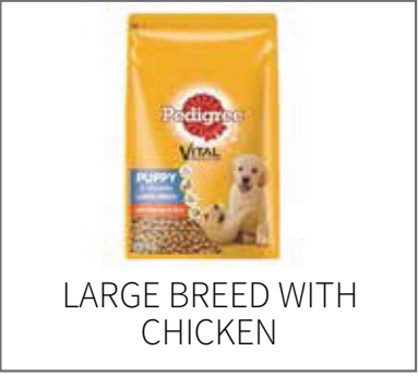
LARGE BREED WITH CHICKEN