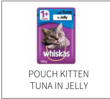
POUCH KITTEN TUNA IN JELLY