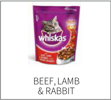
BEEF, LAMB & RABBIT