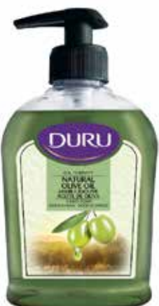
Natural Olive Oil